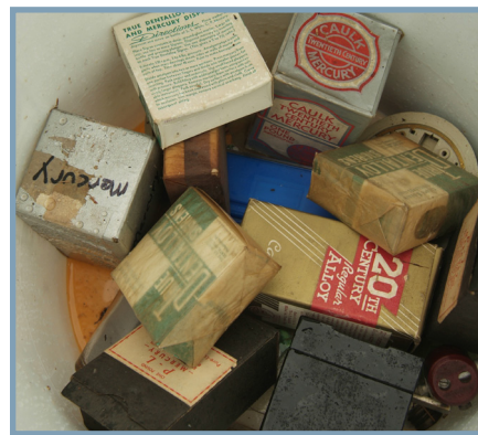
Above: a truck recycling numerous household hazardous wastes. Left: additional household hazardous wastes, including mercury.

Stay tuned for upcoming collection events in 2016. Please visit www.prc.org for more information.