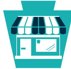
Existing Business Owner

These symbols are used to denote which sections are more useful for new entrepreneurs and which ones contain information geared toward existing business owners. Sections not designated by either icon contain information that is relevant for both types of entrepreneurs.