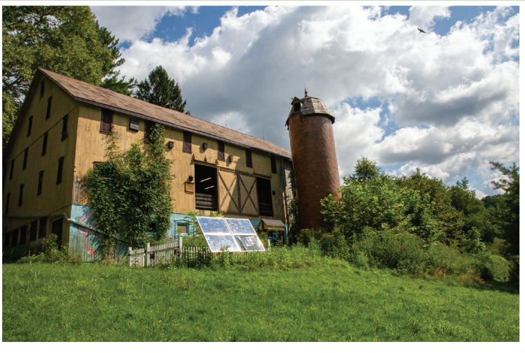
North Park Latodami Nature Center