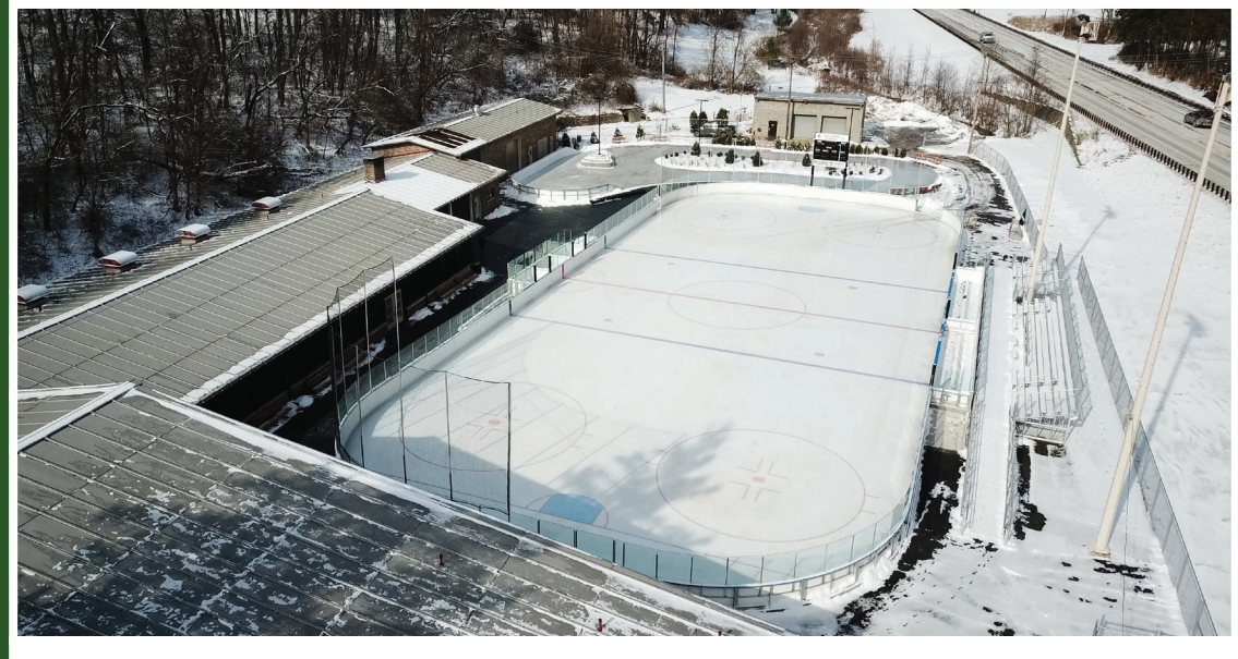
Renovated South Park Ice Rink