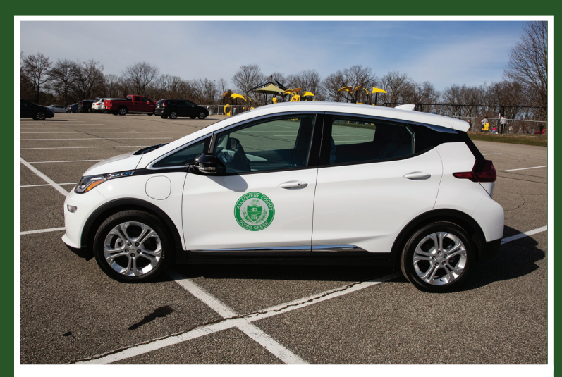
All-Electric Plug-In Vehicle