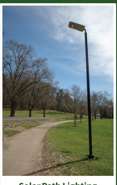
Solar Path Lighting