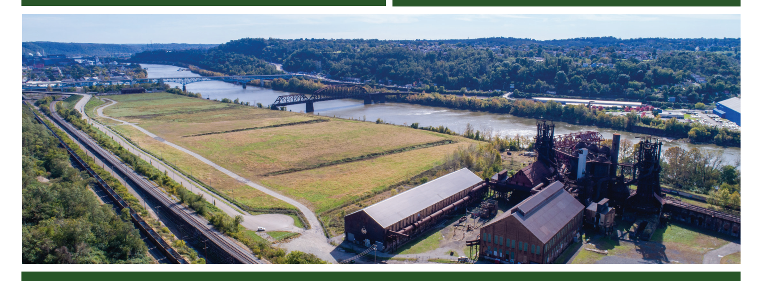
Carrie Furnace Brownfield Site