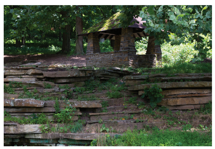
South Park Cascades